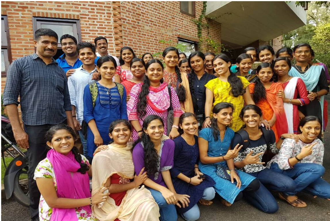
In front of the Centre for Development Studies (CDS), Thiruvananthapuram

We reached CDS, an internationally renowned, self governing research Institute mainly conducting studies related to socio- economic development at 3 pm. The lush green, calm, mesmerizing campus designed by Late Laurie Baker fascinated us.