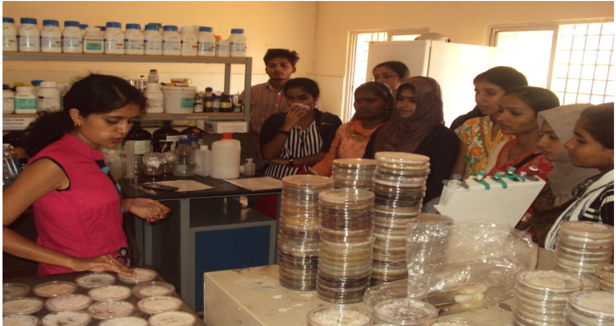
In Ecobiotechnology Lab.