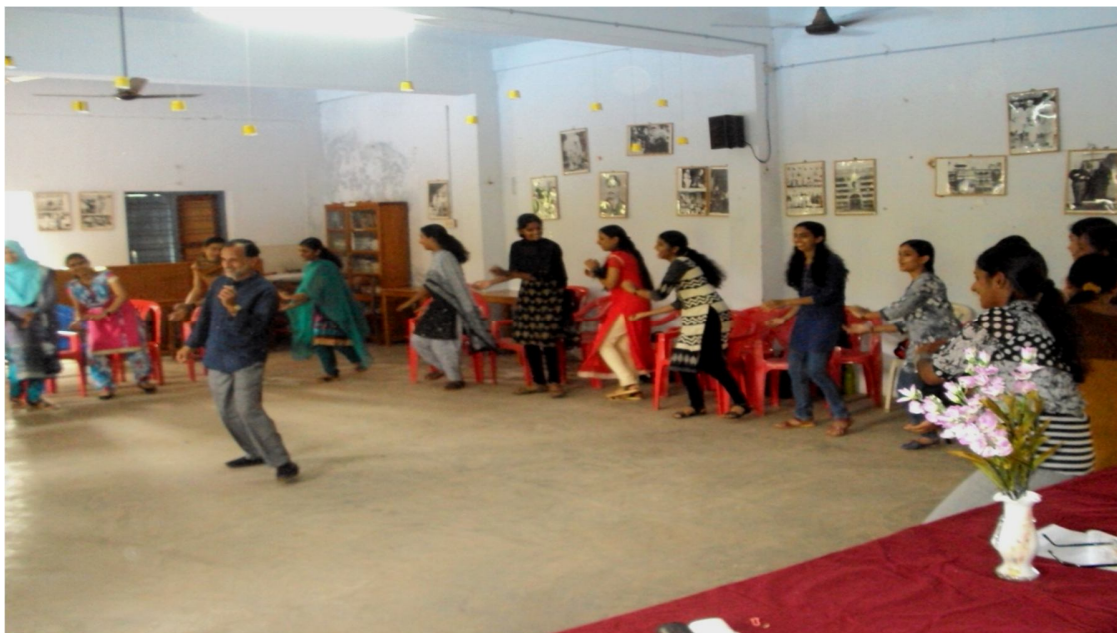
A relaxation programme