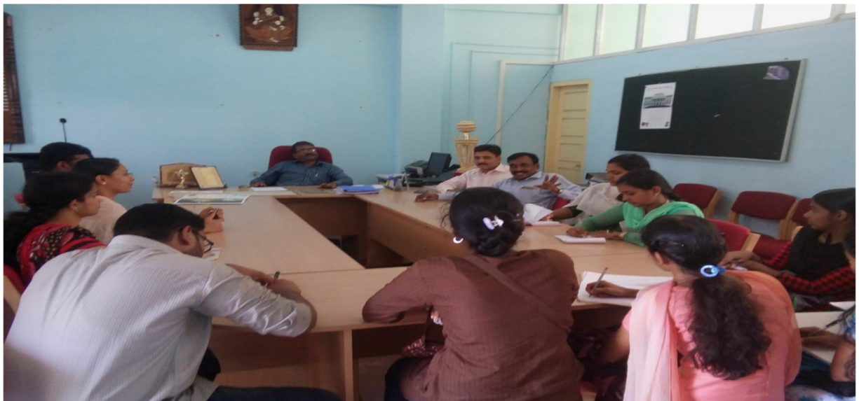
Interaction with Chairman and faculties of Commerce Department