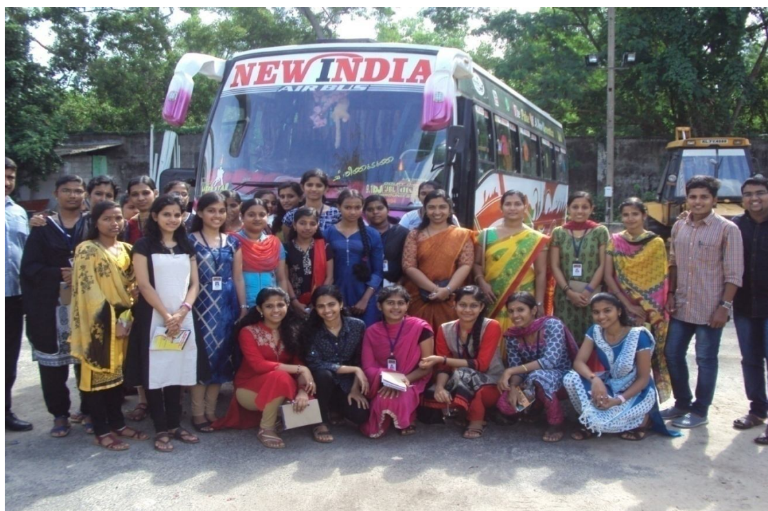
Setting up for a journey to CTCRI, CDS and VSSC, Thiruvananthapuram

As part of external mentoring programmes, we also conducted a motivational visit to institutions of national repute within the State. Thirty mentees from IV and II semesters and 3 accompanying staff including the co-ordinator started their journey in the evening of 19 th June from Kanhangad railway station by the Maveli express, with the noble intention to visit CTCRI, CDS and VSSC. By 6.45 in the morning of 20-06-2017 we reached Trivandrum.