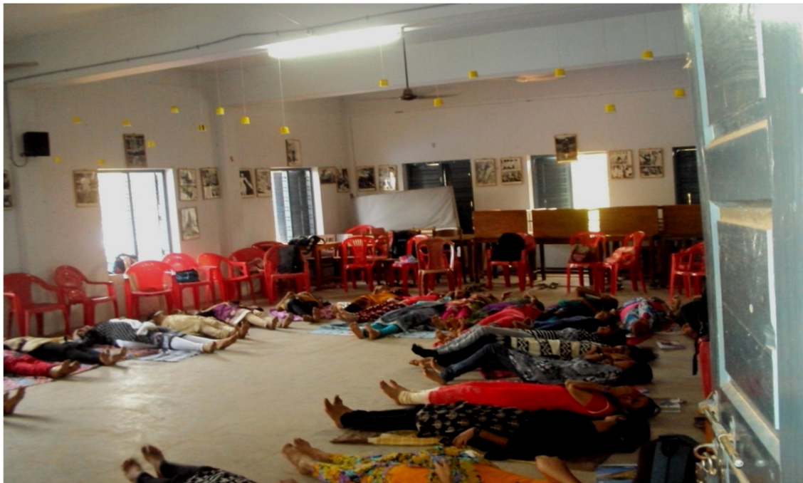
Rejuvenation through Yoga