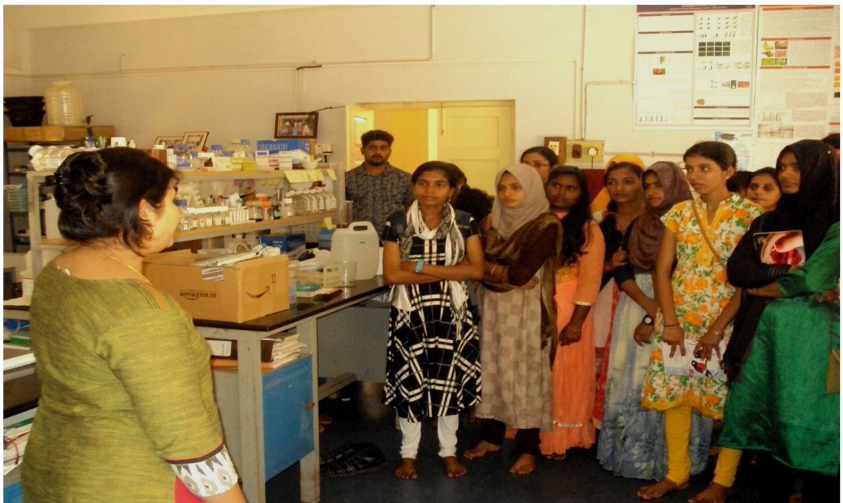
In Molecular Biology and Cancer Research Labs.