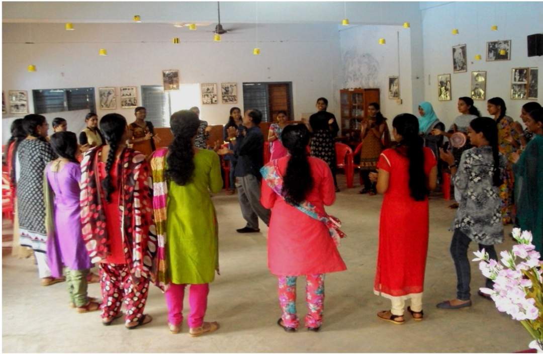
A confidence boosting session