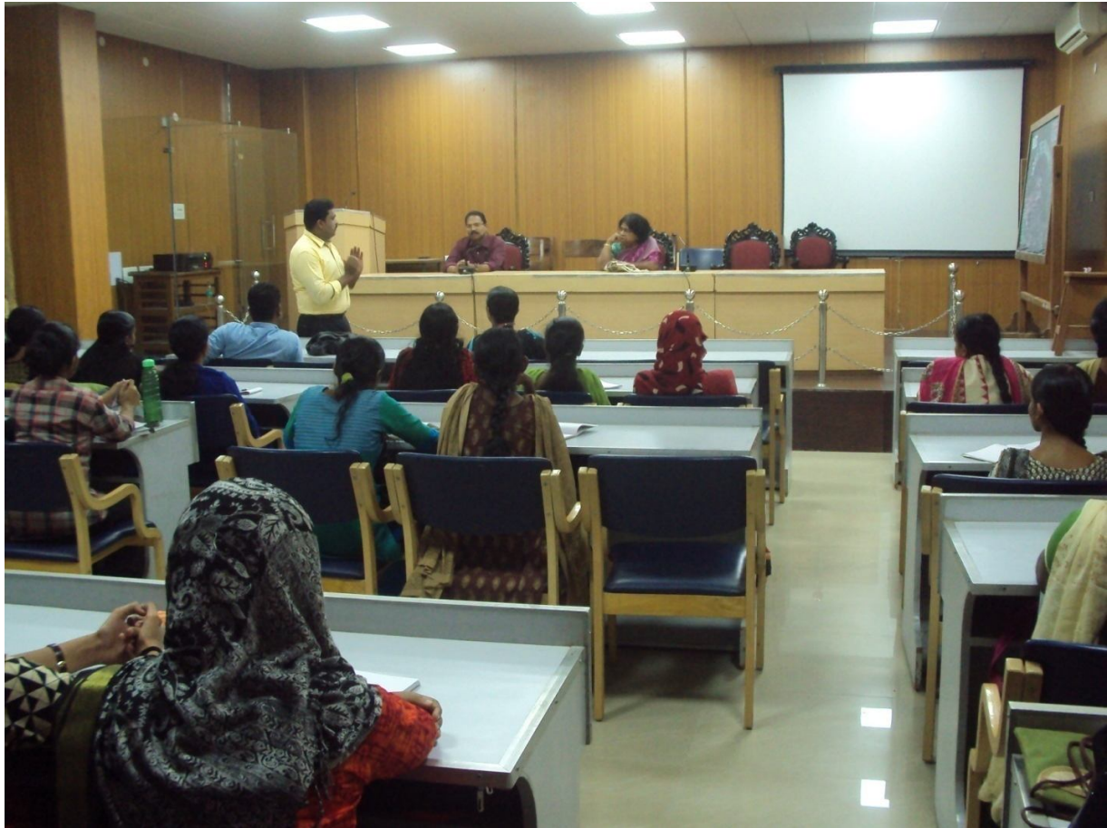
Interactive session with faculties at Regional Institute of Education, Mysore