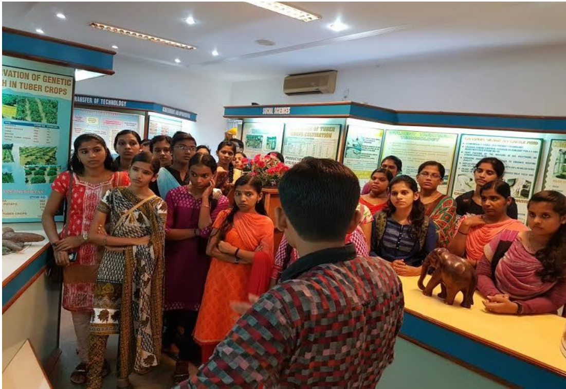
At CTCRI, Sreekariyam, Thiruvananthapuram

in banana, red palm weevil of coconut and stored-product insect pests and other borer pests of tree and fruit crops.