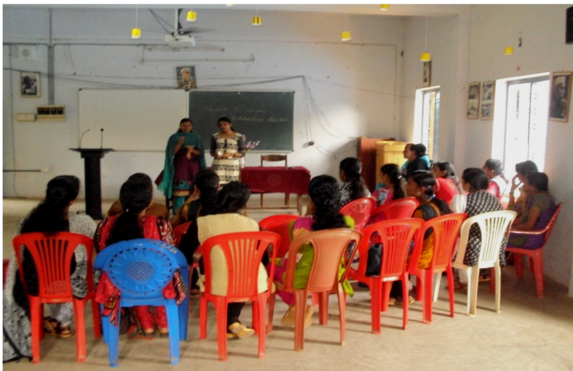
Introducing the other