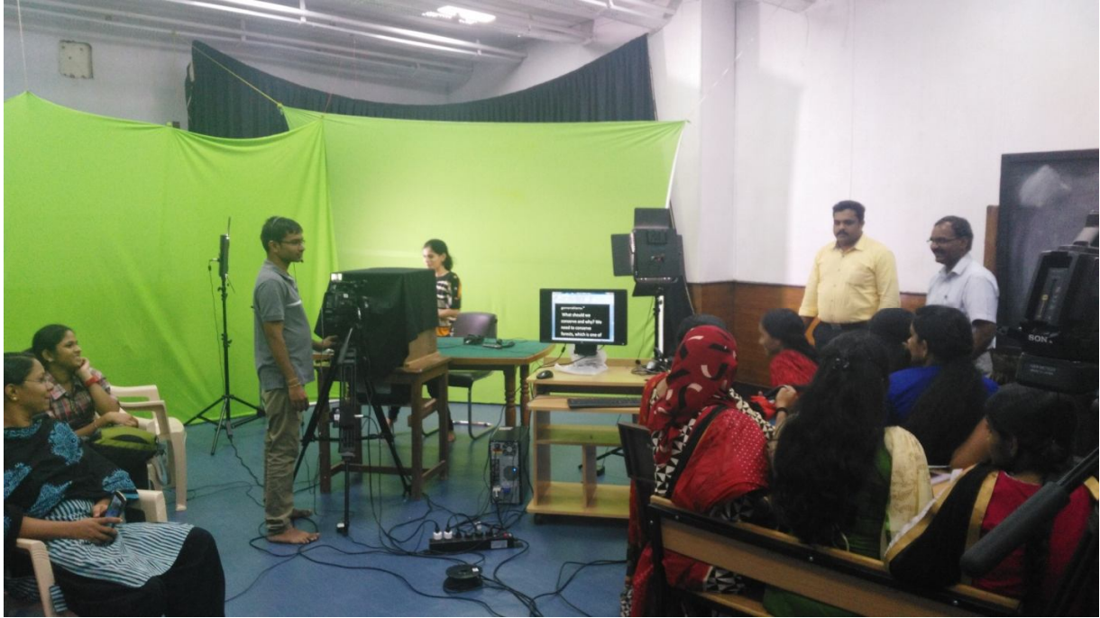
In Education Tech. Laboratory, RIE Mysore

We had our dinner from the hotel at the Camp centre by 7.30 pm. All the students went to their rooms for sleep, as most of them were tired due to tiring journey of the previous night.